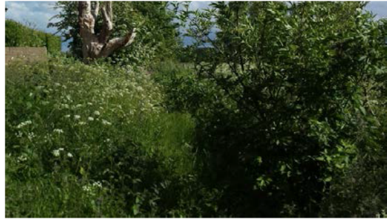
B) HEAVILY UNDER MAINTAINED / OVERGROWN DITCHES ALONG SW BOUNDARY