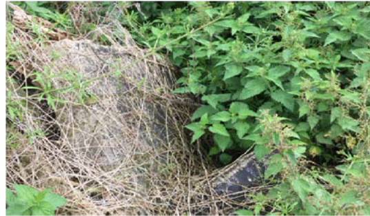
C) BUILD UP OF HEDGE/ FIELD TRIMMINGS AND OTHER WASTE