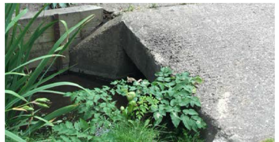
A) INFILLED AND UNDERSIZED OR OVERGROWING CULVERTS ALONG CHAPEL LANE